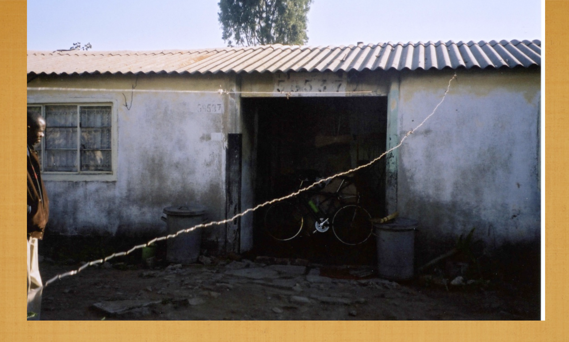
BARELY ROOM: LODGING (PRIVATE RENTAL), MIGRATION & FOOD SECURITY IN AFRICAN CITIES